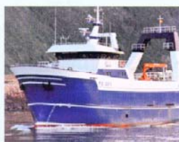
On board Machines