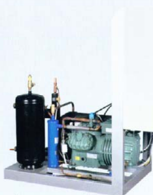
+ Compressor unit