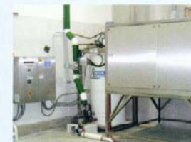
Ice Dosing Systems