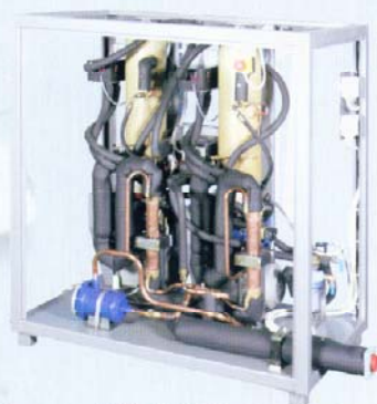
UBE 5.000 R = UBE 5.000 E