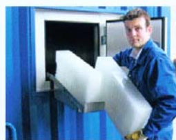
Container + Block ice